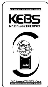
Import Standardization Mark SYMBOL FOR PRODUCT QUALITY